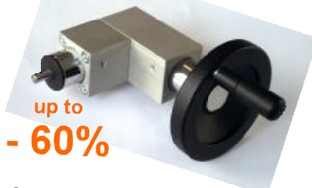
up to - 60%