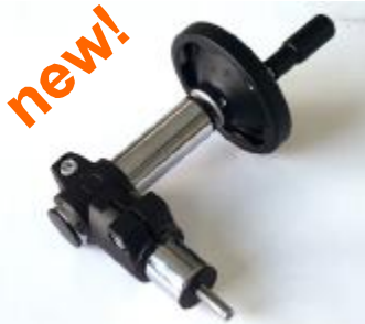
new! Compact, well-priced as aluminium cast casings