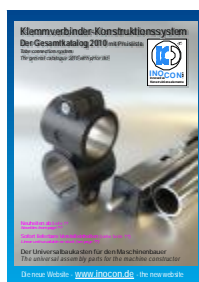
Catalogue 2010 Available February 2010