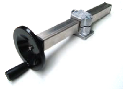
Square-tube linear units: for higher torsion rigidity

Be informed about your perfect INOCON-connection