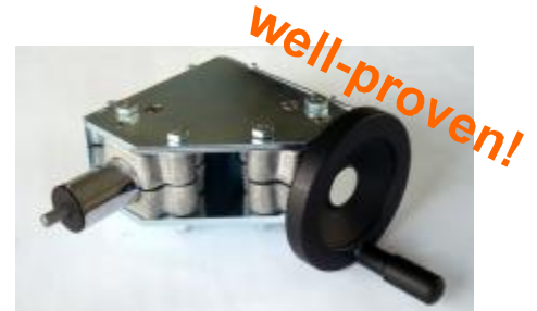
well-proven! Robust, galvanised steel construction